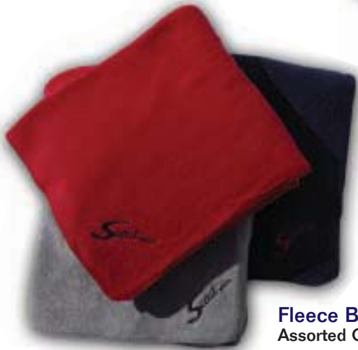
Fleece Blanket Assorted Colors SPECIAL PRICE: $12.00