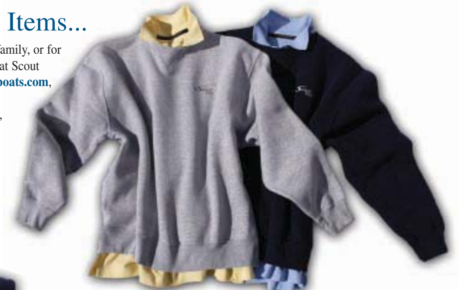
Cotton Crew Sweatshirt Colors: Navy or Grey • Sizes S-XL SPECIAL PRICE: $14.00

Please allow approximately two weeks for delivery on all in-stock items.