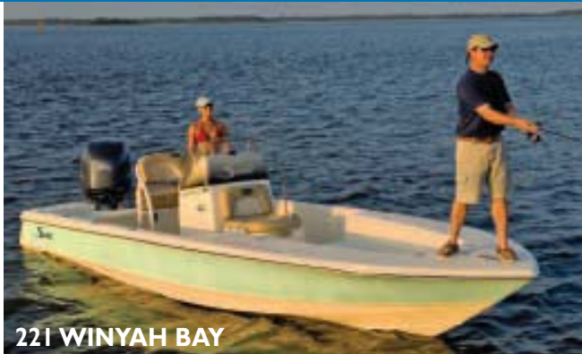
221 WINYAH BAY

The newly-redesigned 187 Sportfish is the perfect example of how Scout can take an already popular model and make it even better. It sports an improved deck layout which offers unparalleled comfort and style. Weighing in at approximately 1,450 lbs (without engines), the 187 SF is easily trailerable and fun to maneuver inshore or offshore.