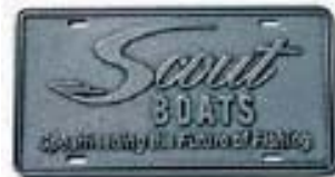
Pewter License Plate $30.00