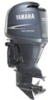
F150TXR / LF150TXR